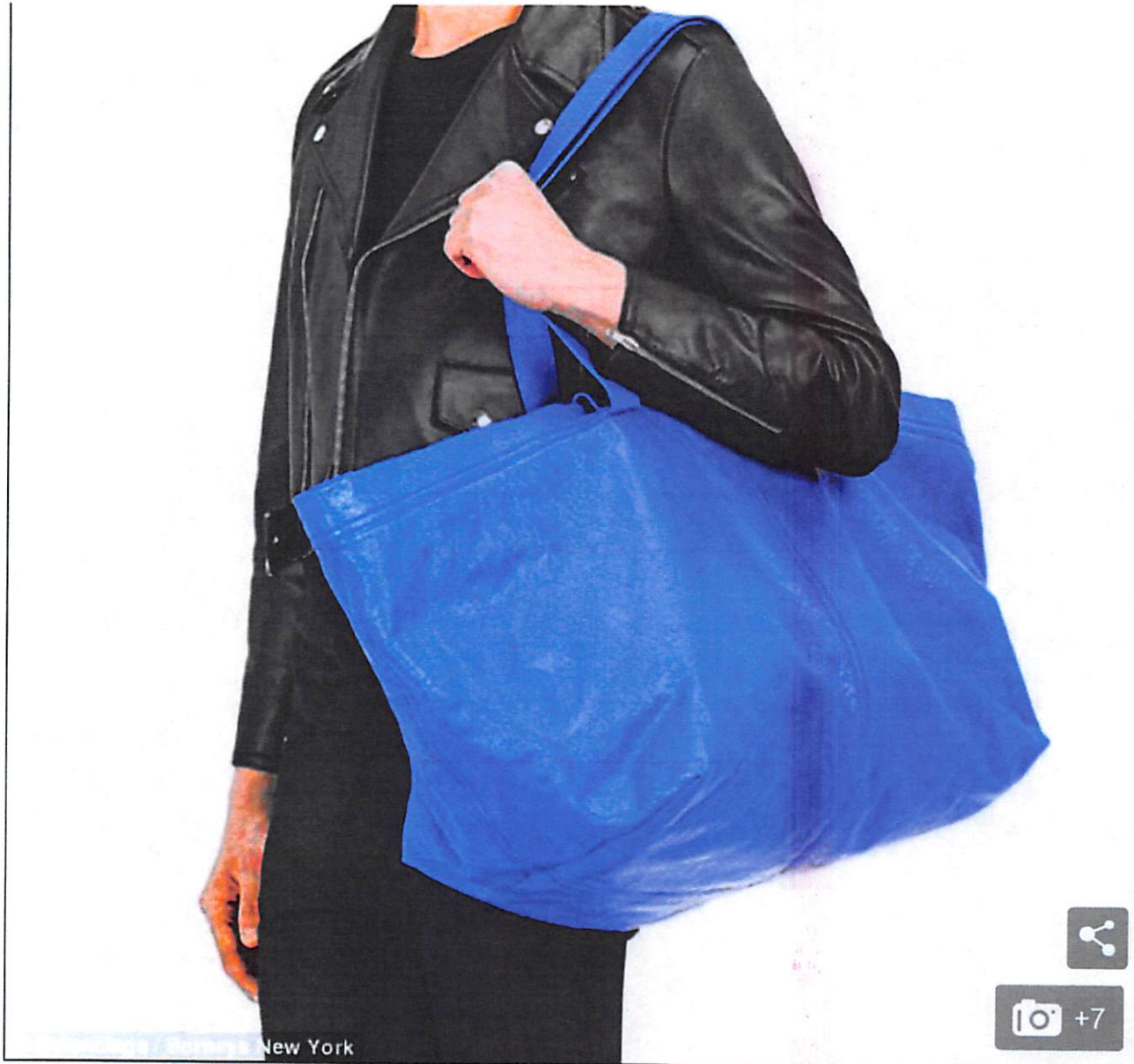
Sweet nothings: IKEA says they are 'deeply flattered' by the similarities to their classic 99-cent tote bag