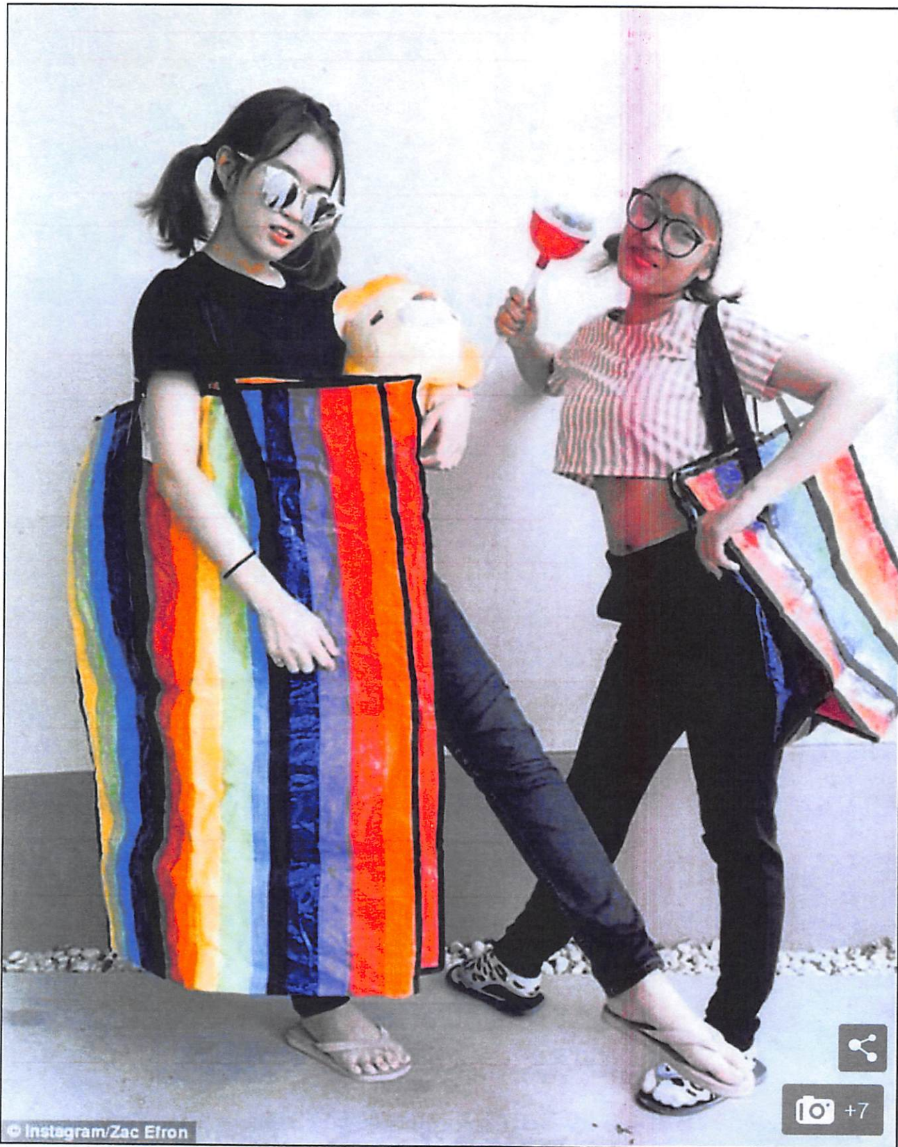
Ahead of the curve: Thai fashionistas quickly noted the similarities between Balenciaga's colorful tote (which retails for thousands) and Thai laundry bags (which cost pennies)